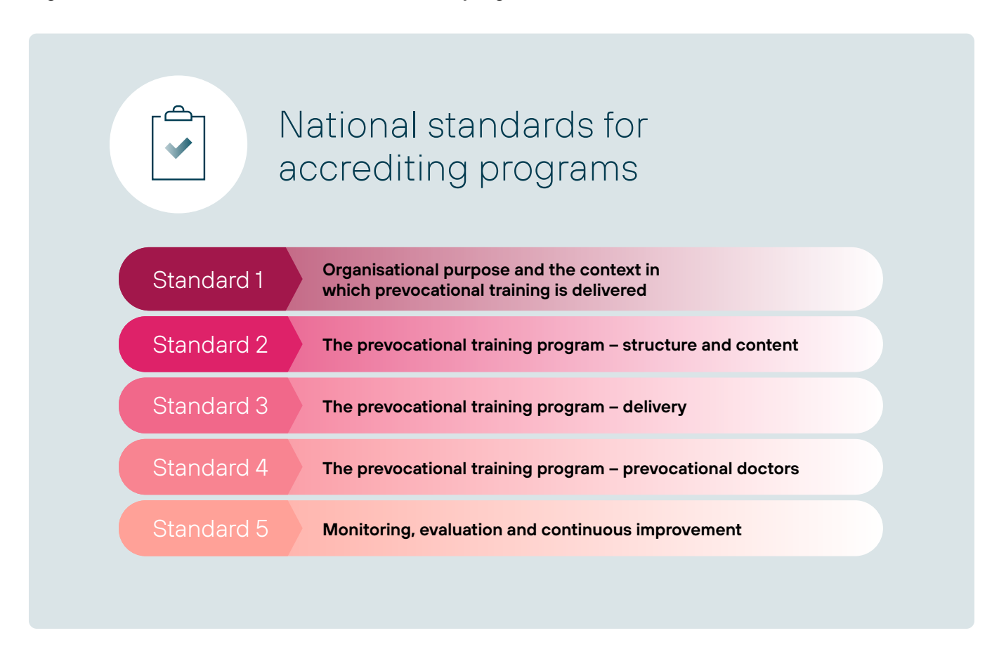
Figure 3 - National accreditation standards for programs