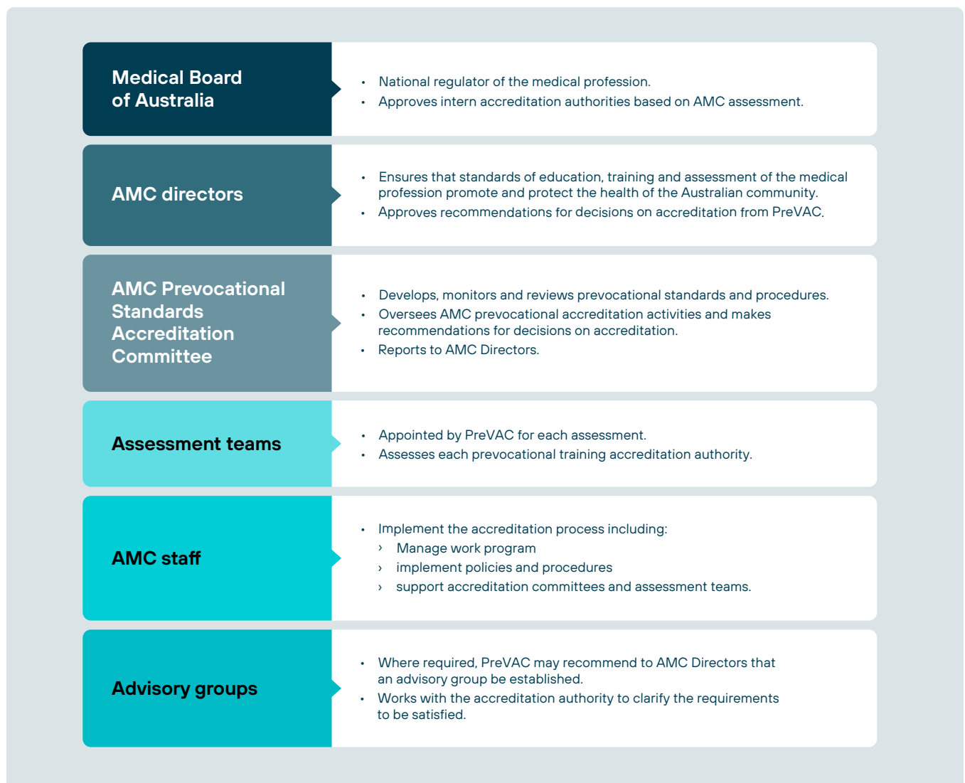
Figure 4 – Groups involved in managing the accreditation process

Where possible these procedures are aligned with procedures for accreditation of medical schools and specialty colleges. However, prevocational training accreditation authorities are not education providers, and so the AMC has set national standards and procedures that reflect this difference using criteria similar to those used to assess the AMC's own work as an accreditation authority under the Health Practitioner Regulation National Law .